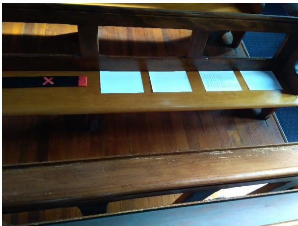
Distancing strip for the pews in the middle row